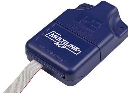
USB Multilink ACP Debug Probe